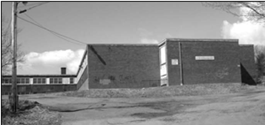
HRM has received two applications for its "call for proposals" on the BC Silver School. The Business Commission has encouraged the city to look carefully at the site before making a decision that may impact long term improvements to the community.

A decision to proceed at this point in time with what may be a single family housing project is at least a 50 to 100